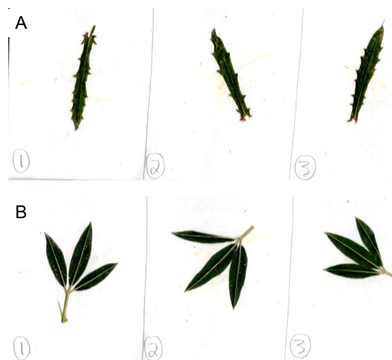
Figure 2. Leaf scans for (A) Machaeranthera canescens and (B) Cleome serrulata that will be used to calculate specific leaf area.

During 2018 field work, USGS collected plant trait data including plant height, specific leaf area (SLA), and leaf tissues to quantify carbon and nitrogen levels at environmentally-stratified sites across the Colorado Plateau (Fig. 2). Data collection at some sites and for some species was hindered by dry spring growing conditions, as noted above. As such, instead of focusing on generating complete datasets for the FY17 and FY18 species included in genetics analyses (as explained in the FY18 SOW), our strategy was to collect data for priority species as they were encountered. The result of this protocol modification is that it will take at least one more field season to collect a full plant trait dataset for the original set of species (i.e., the species undergoing genetic analyses in FY17 and FY18), but the overall time that it will take to collect data on a larger set of species will remain the same (i.e., some future work is already complete, while some proposed work is incomplete). Plant trait data were collected for 17 species across 88 sampling locations; specifically, we collected 815 leaf samples to characterize SLA and 1,242 tissues samples for